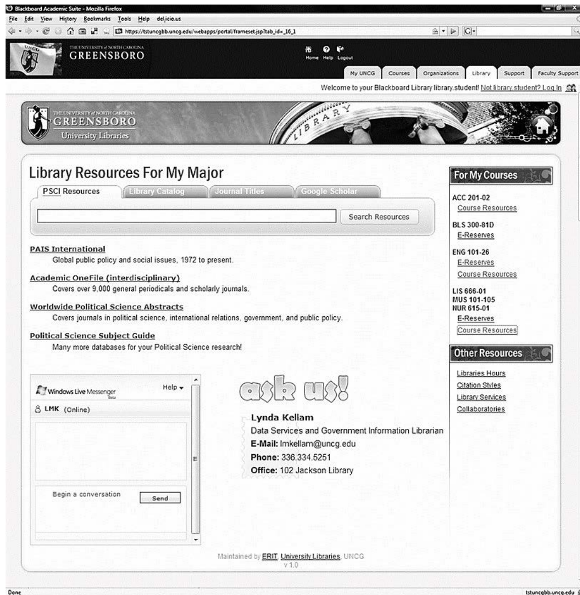
FIGURE 4 UNCG's Blackboard portal for political science majors.

To create the portal, two main pieces of information were acquired: first, the status of the individual logging in (i.e., faculty, student, or staff) and second, the declared majors or areas of study of the students. Faculty and staff members see a generic screen with a link to the library catalog and other tools. Students, on the other hand, see library resources chosen by our subject specialist librarians and geared toward their specific major (see Figure 4). For example, an education major logged into Blackboard would have links to ERIC and Education Index. Subject specialists could choose to display any of the databases, external Web sites, or links to library Web pages, such as a department's subject guide—a static HTML page created by the subject specialist librarians and available for each department. 2