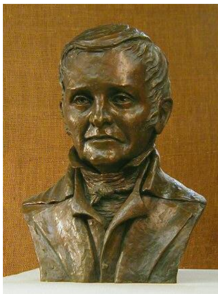
Figure 1. Bust of David Caldwell by Michel Van der Sommen. © 2007 Michel Van der Sommen