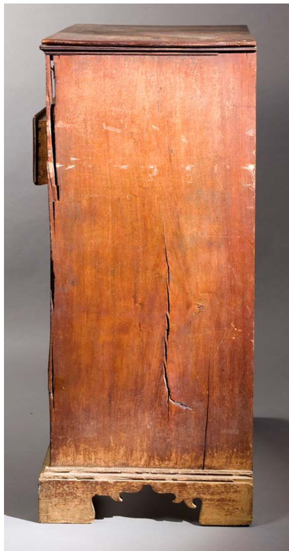
Figure 5: Courtesy MESDA, Acc No 5503.2

The chest is very striking; however, it lost some of its aesthetic beauty over time owing to construction errors. An unskillful combination of green and dry wood was used in construction. Cathy nailed along the entire length of the interior drawer rails, restricting the wood’s natural expansion and contraction. Heavy scribe lines were used to guide the placement of the drawer rails. The drying process, constant expanding and contracting, and