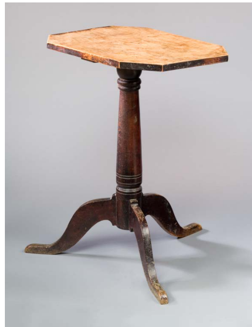
Figure 2: Cathey Candlestand, Courtesy MESDA, Acc No 5503-5