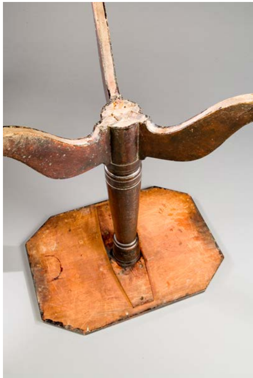
Figure 4: Acc No 5503

The candlestand is constructed entirely of birch and likely dates from the 1820s to 1840s. 42 It also appears to retain its original red-wash surface paint except for the one