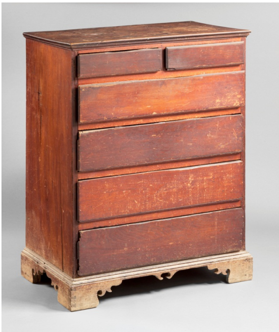
Figure 1: Restored Cathey Tall Chest, Acc No 5503-2a

Wild describes the unknown, the untraditional, the unfamiliar. Wild things escape our ordinary classifications. “Wildness is simply the elusive and ambiguous nature of things, the construction of meaning in a historical, cultural, and critical context.” 1 Wildness “helps the viewer look at ordinary things in a new way, making them a bit strange.” 2 This new look gives us an enlightening perspective and transforms our view of the maker and his work. MESDA’s Cathey chest and candlestand are examples of different conceptions of the expected classic style of a chest and candlestand. These pieces exemplify how backcountry decorative arts embody this wildness. William Cathey is said to have made this tall chest and candlestand in Rabun County, Georgia. However, it is possible he did not create them in the hinterlands of Rabun County, Georgia, but in the mountains of North Carolina.