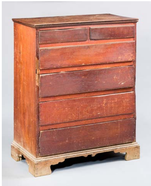
Figure 3: Unrestored Tall Chest, Image Courtesy MESDA Acc No 5503.2

the lore, tools and hardware typically used in cabinet-making, but he produced an atypical chest and candlestand.