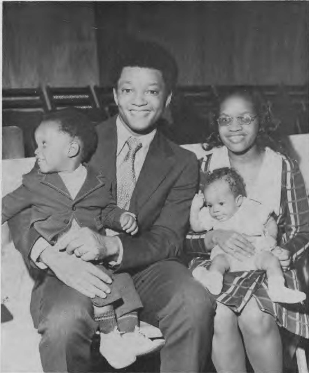
PASTOR'S DAUGHTER AND FAMILY