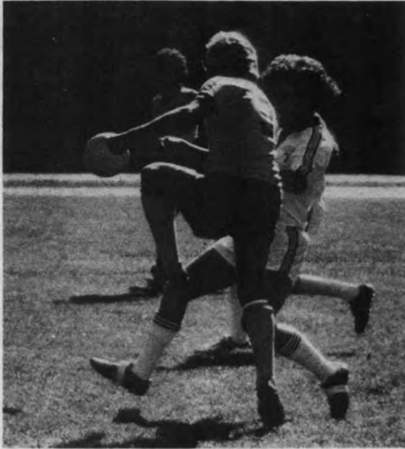
Soccer action in Asheville.

Sometime in November, plans will be submitted for a new soccer field to be placed where the hockey field is now located. Bleachers and lights will also be provided, and construction should begin sometime in January.