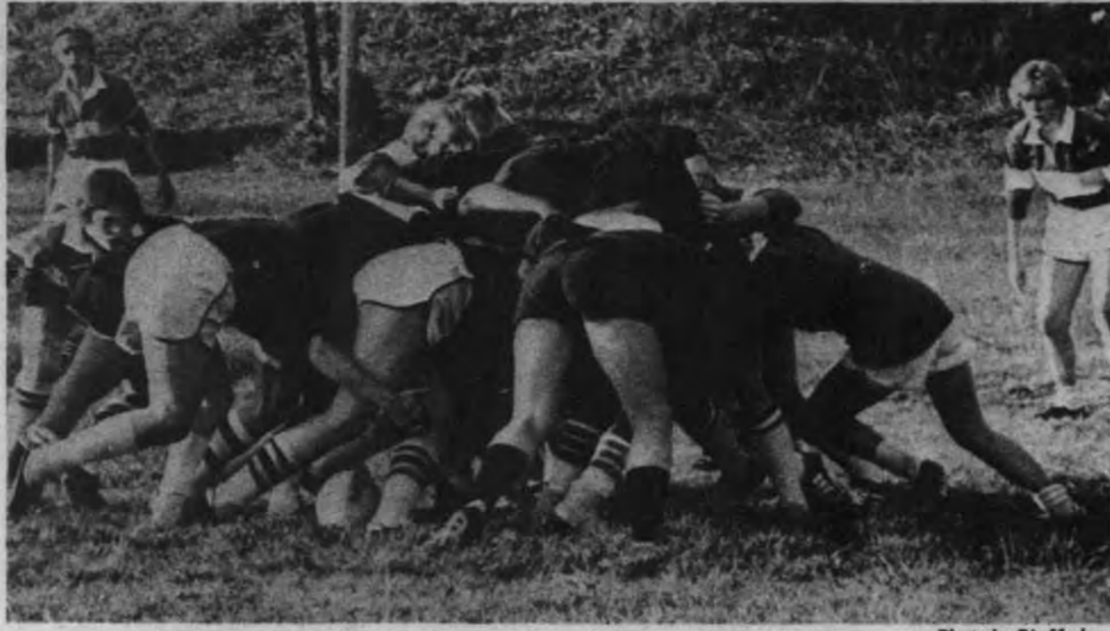
Lady Thunderhighs set up for scrum in action last Sunday.

The next meeting of the fencing club will be Tuesday night, October 30 in the main gymnasium of Rosenthal Gym at 7:00 p.m.