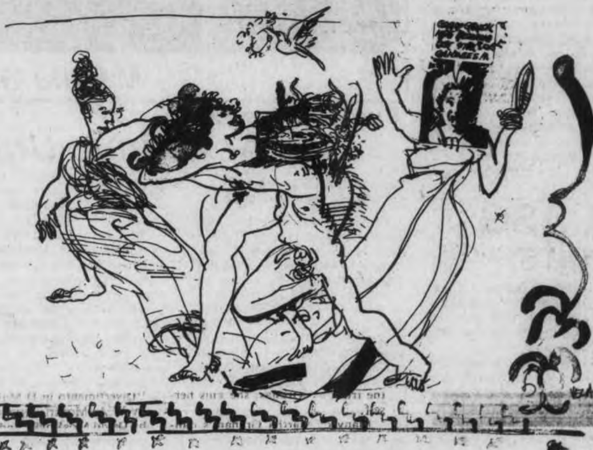
Communism Taming Capitalism

Other local businesses have also planned special activities.