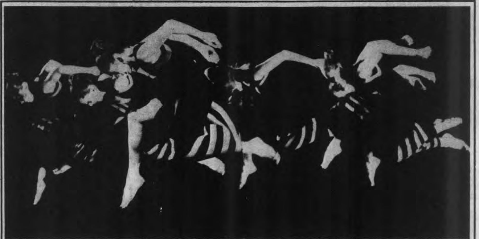
Martha Graham Dance Co. (See page 3.)