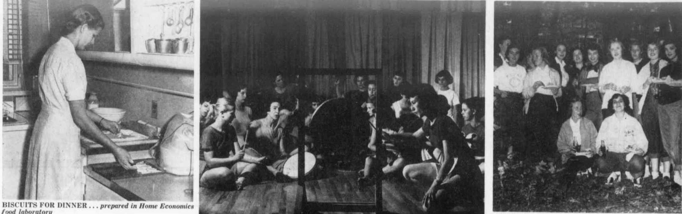
BISCUITS FOR DINNER . . . prepared in Home Economics food laboratory