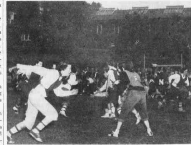
HALLBALL . . . sports sensation at Woman's College. Extra-curricula game played first time in history of sports

When the student body has pork chops at a family-style dinner, 775 lbs. of pork loin are bought; 1400 lbs. of turkey are eaten at Christmas; and at a normal family meal 25 lbs. of butter are consumed.