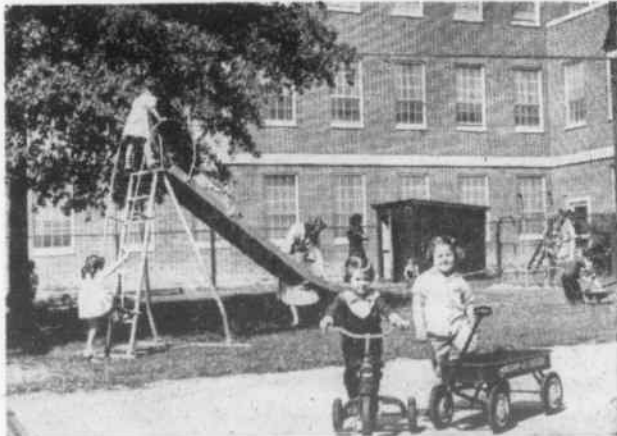
CITIZENS OF TOMORROW . . . work and play at Woman's College Nursery School

Alumnae gifts yield Alma Mater greatness.