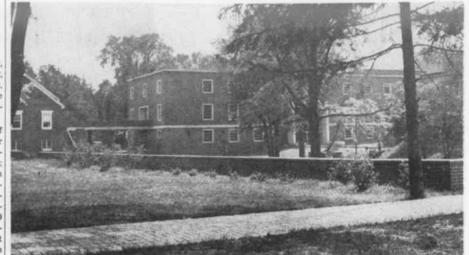
ELLIOTT HALL . . . linked to Soda Shop, will be center of campus social activity

Elliott Hall will serve as a central social and recreational area meeting the needs of all groups, large or small; it will be the service center of the campus; it will offer cultural and creative outlets; and it will act as an education medium through the role that students will play in its organization and administration.