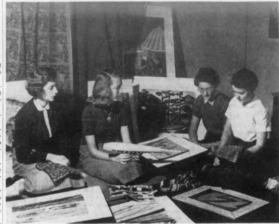
STUDENT ARTS FORUM COMMITTEE . . . chooses paintings for 1952-53 Arts Forum display