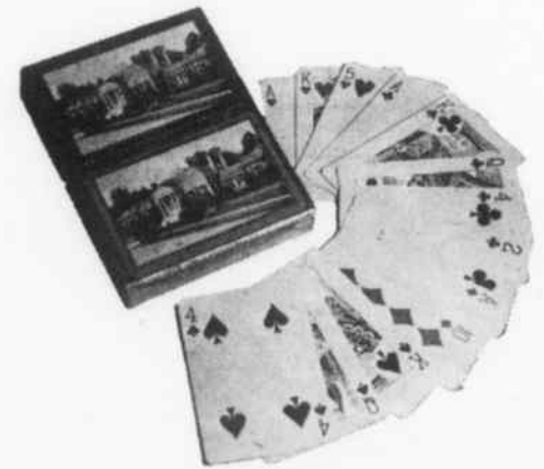
ENCHANTMENT QUALITY CARDS with ALUMNAE HOUSE BACKS