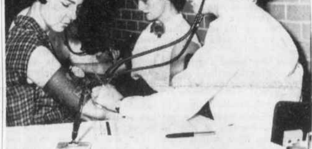
STUDENT VOLUNTEERS . . . donate blood for armed forces use on battlefield . . . May 6, 1952—257 students and faculty exceeded the college quota when they gave blood to the Red Cross Bloodmobile operation at Woman's College