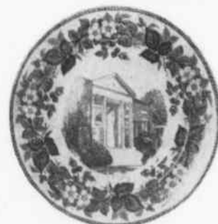
WEDGWOOD BLUE OR MULBERRY