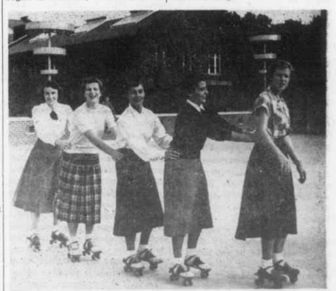
CONGA LINE . . . on the skating rink, no less. Skate lovers meet in group on Saturday afternoon

The rink is available each Monday night for those who enjoy the sport or who would like to learn roller skating.